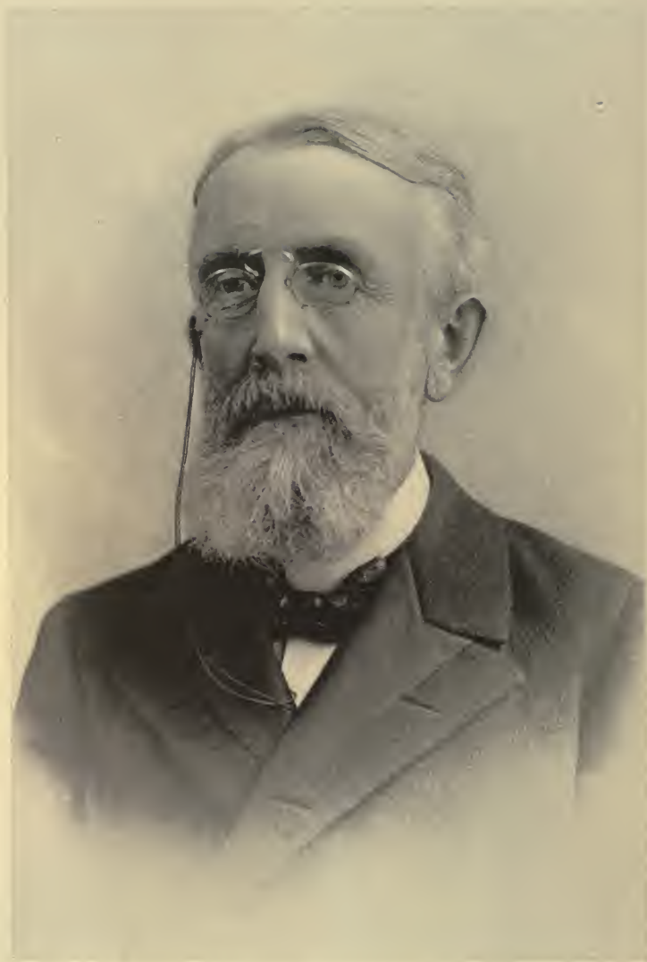
The Hague, 1899